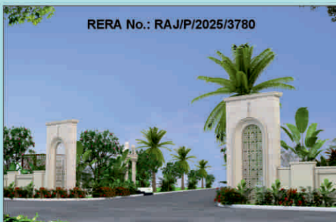
Bhumija Empire-1 st Empire-1 st