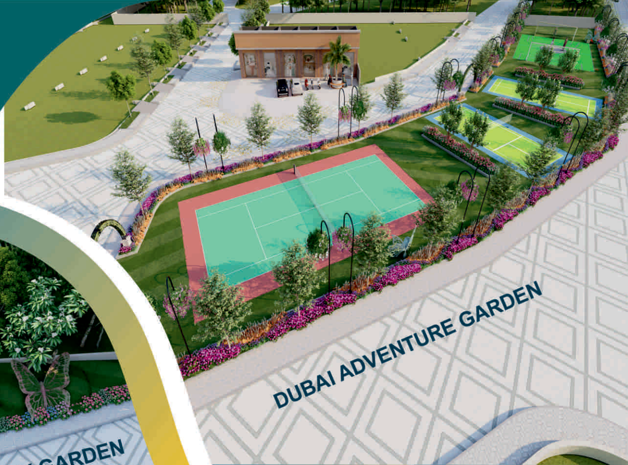
DUBAI ADVENTURE GARDEN