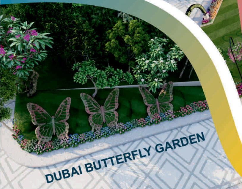
DUBAI BUTTERFLY GARDEN