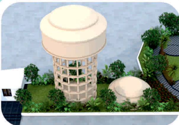
OHSR & CWR WATER TANK