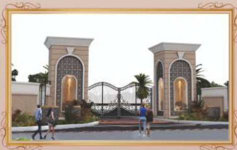
ROYAL BHUMIJA (MACHDA, NEW LOHA MANDI, SIKAR ROAD)