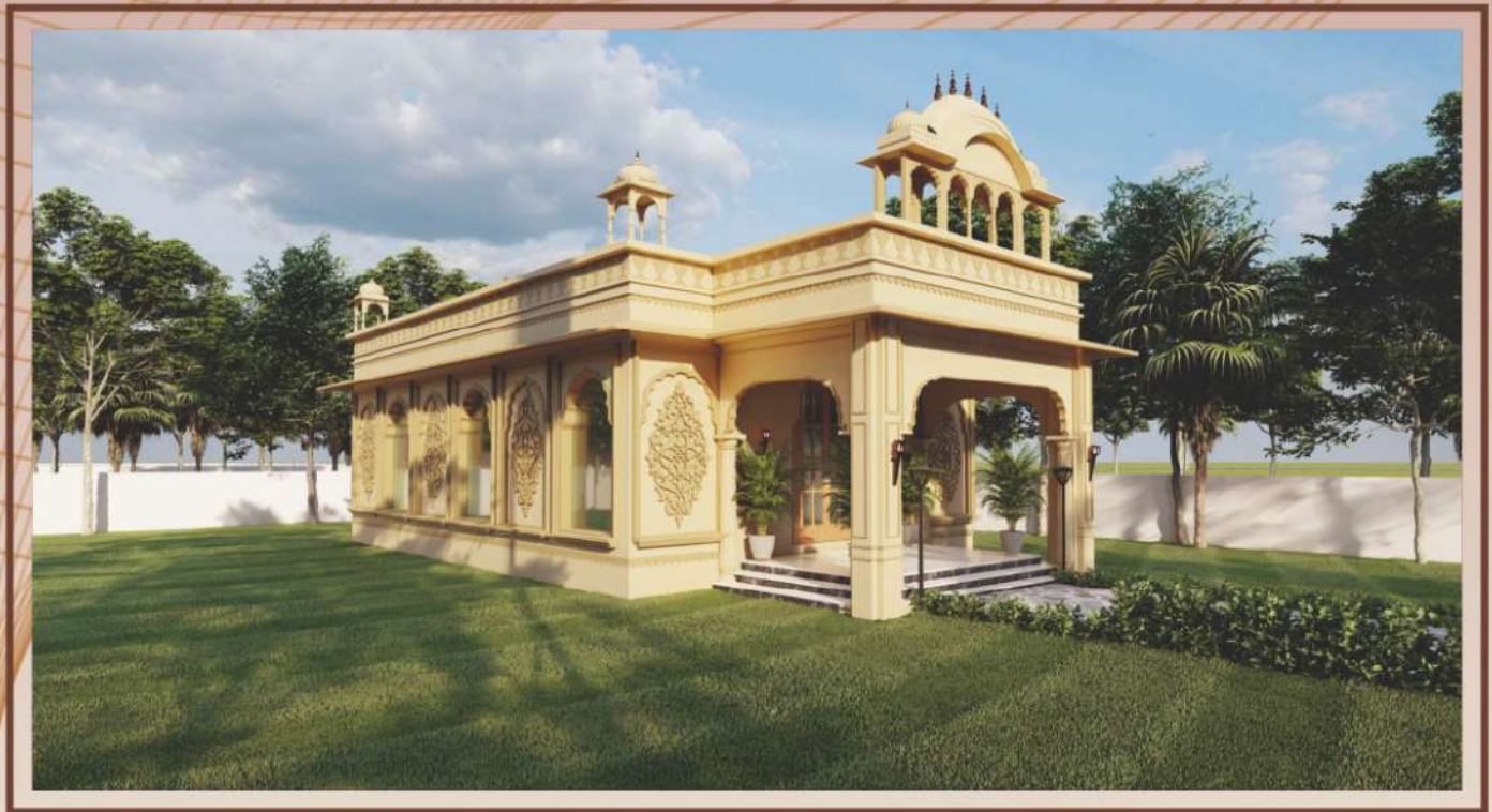
PRATAP COMMUNITY HALL