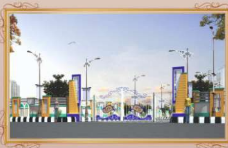
BHUMIJA PRANGAN (VILLAGE BINDAYAKA, TEHSIL-JAIPUR)