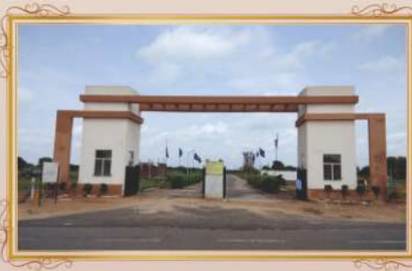
THE ROYAL CITY EXTENSION (VILLAGE MAHARAJPURA, TEHSIL JAIPUR)