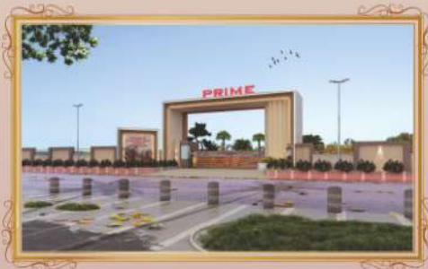
BHUMIJA PRIME (BINDAYAKA, JAIPUR)