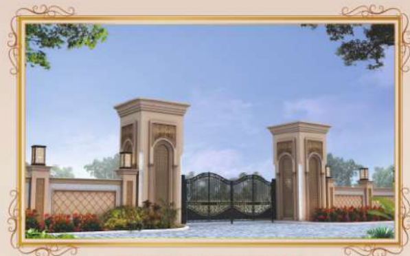
BHUMIJA RESIDENCY (VILLAGE JAISINGHPURA BAS BHANKROTA JAIPUR)