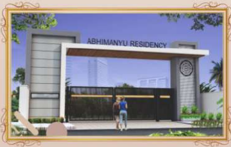
ABHIMANYU RESIDENCY (MANDAU, SANGANER, JAIPUR)