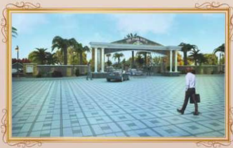
THE PARK ROYAL (SHRIRAMPURA WAS MUKUNDPURA, TEHSIL JAIPUR)