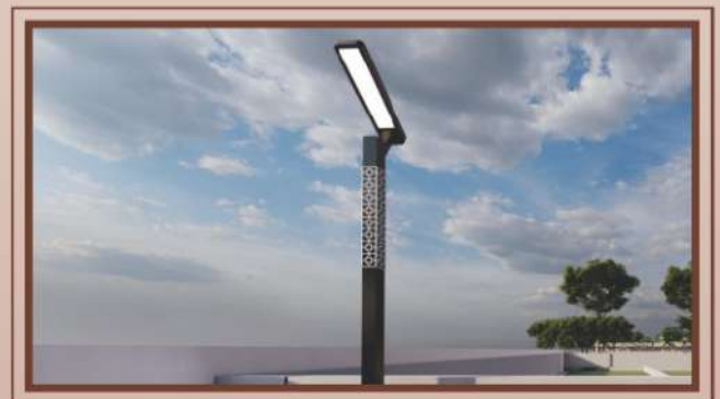
SMART LED STREET LIGHT

This signage not only directs and informs but also imparts a sense of belonging and pride to all residents and visitors.