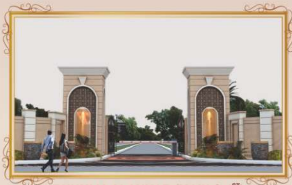
BHUMIJA ALANKAR (MAIN & 1 ST ) AT KHASRA NO. 564, VILLAGE-SIWAR, JAIPUR

Bhumija Group is a well-established, experienced and renowned name in the field of land developers in Rajasthan. Our focus is on building lasting relationships and delivering excellence in style, quality and substance. Bhumija Group is the name of determination and faith which is continuously creating records in the the field of real estate through the use of new technology and innovation. Bhumija Group's strong team with a commitment and vision also plans to give comprehensive solutions to the people in terms of townships development. Bhumija group prepares all the projects keeping in mind the present and future needs of the people and upcoming engineering in the most appropriate manner.